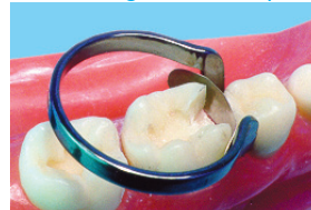
1 Garrison is a trademark of the Garrison Dental Supply Co.