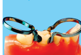
Two Rings Stacked